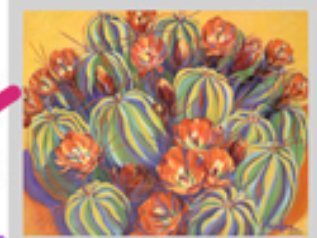
Jacci Weller 284 Tusher Street