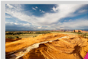
Bruce Hucko 668 Mountain View

Enjoy The Music! We'll be Waiting for YOU!