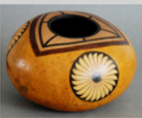
Bob Ridges 3059 Desert Road