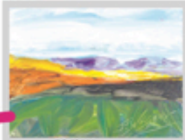
Phil Wagner 99 North 400 East