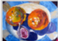
Robin Straub 99 North 400 East