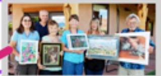
JC's Pastel Posse 1010 Pear Tree Lane 7 Artists - ONE STOP