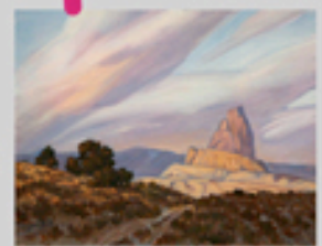
Tim Morse 1010 Pear Tree Lane