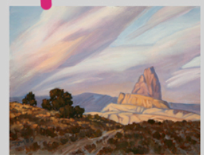
Tim Morse 1010 Pear Tree Lane