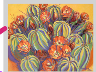
Jacqui Weller 284 Tusher Street