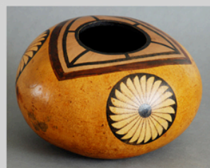
Bob Ridges 3059 Desert Road