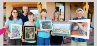
JC's Pastel Posse 1010 Pear Tree Lane 7 Artists - ONE STOP

Enjoy The Music! We'll be Waiting for YOU!