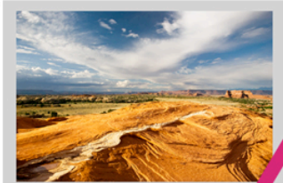
Bruce Hucko 668 Mountain View