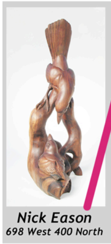
Nick Eason 698 West 400 North

think of it as an art treasure hunt!! we'll have signs by our houses and maybe a bike rack!! the blue line suggests good bike routes